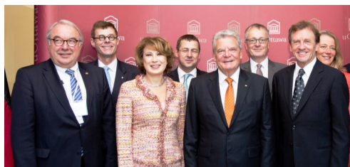
President Gauck's visit to uOttawa